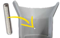
Figure 2: There are two holes below the instrument holder. Insert angled internal circlip pliers into these holes and squeeze the pliers. This releases the tension of the locking mechanism, and the instrument holder can be removed upwards.

Figure 1: In the center of the inner radius of the instrument holder, there is a fixing pin (diameter 2 mm). Push this pin through to the back into the strip of the instrument holder support. Use a sturdy paper clip or a needle with a maximum diameter of 2 mm. A new fixing pin is included with the replacement instrument holder.