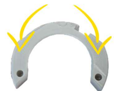
Figure 3: Carefully pull the instrument holder upwards. It is essential to ensure that the cable connections are not damaged.

Figure 2: There are two holes below the instrument holder. Insert angled internal circlip pliers into these holes and squeeze the pliers. This releases the tension of the locking mechanism, and the instrument holder can be removed upwards.